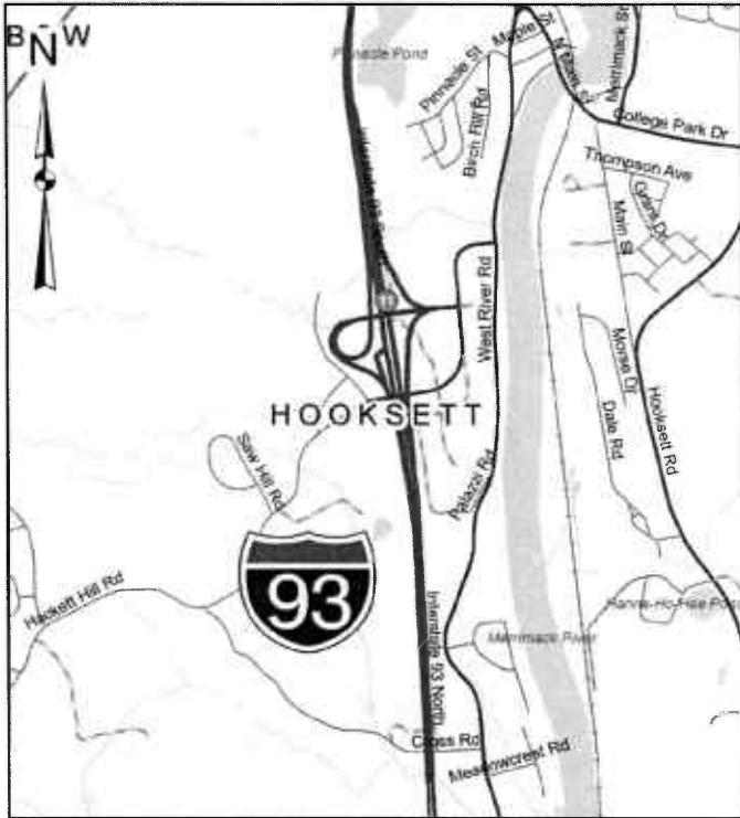
2" Mill and Fill on I-93 from MM29.5 to MM27.45