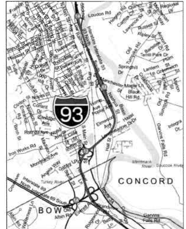
Crack Seal I-93 from MM 38.4 to MM 34.8