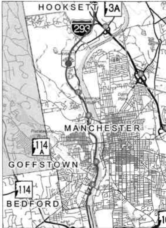
Crack Seal I-293 from MM 11.4 to MM 4.6